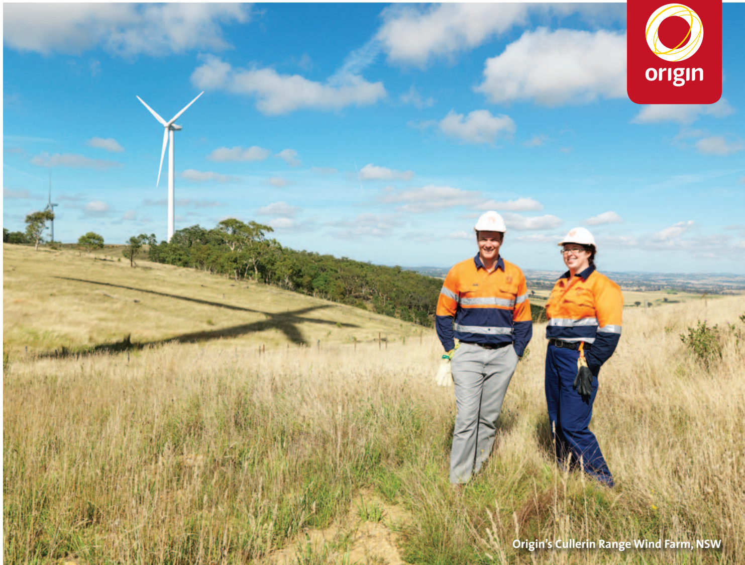
Origin's Cullerin Range Wind Farm, NSW